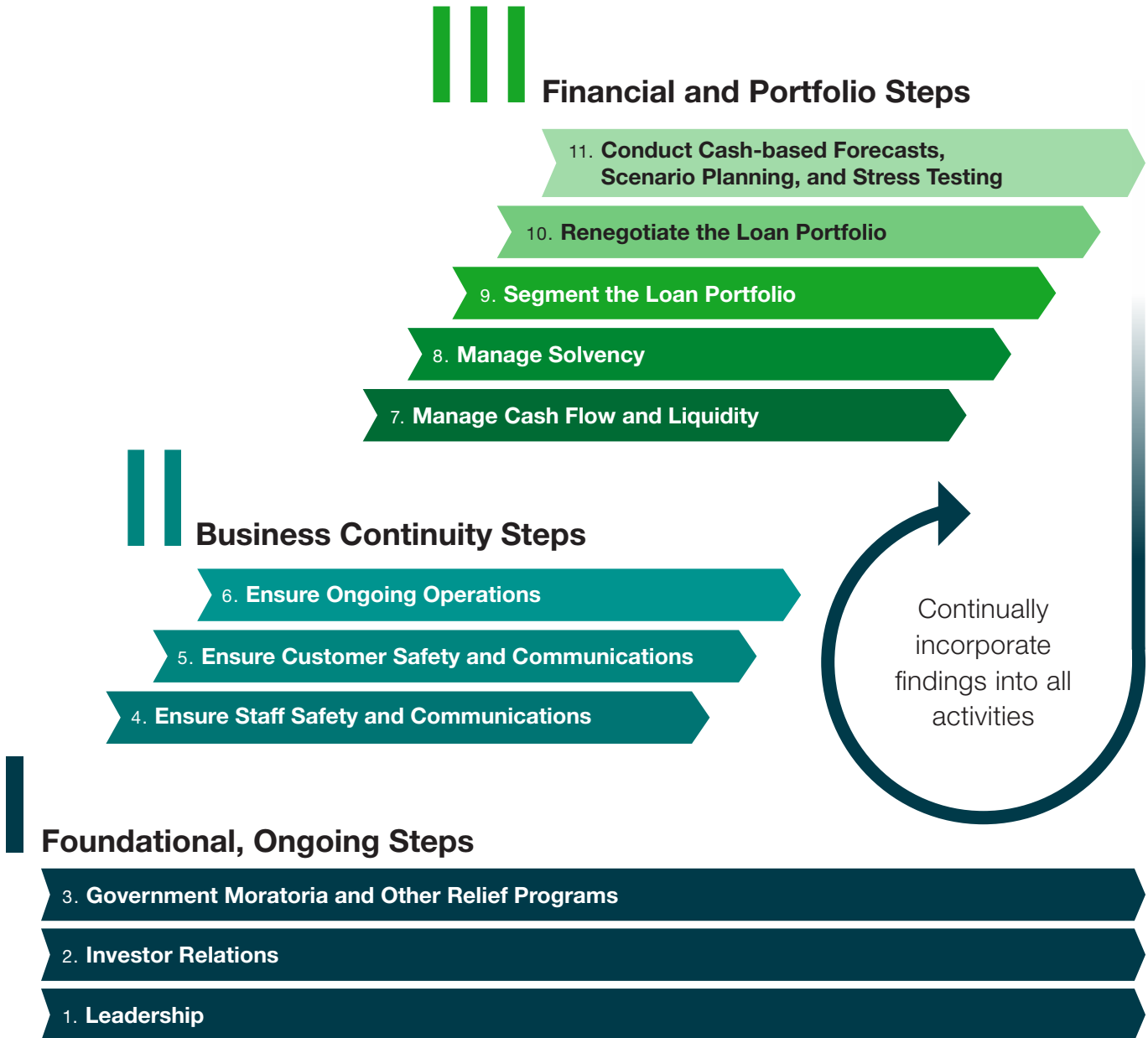
FIGURE 1. COVID-19 Crisis Roadmap Sections