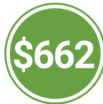
Average amount of loss per theft

The impacts of theft include group decapitalization, reduced rates of return, group dissolution, loss of member savings, reduced member confidence and physical violence – all of which can devastate affected groups and generate great concern among other groups as reports of theft spread. As Savings Groups mature and proliferate in a community – and become more visible – the risk of theft is heightened, particularly in areas with low levels of security.